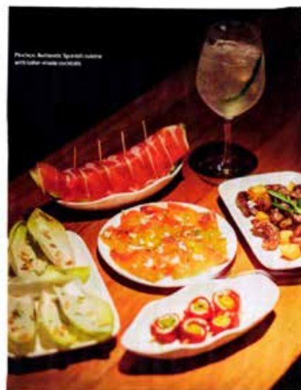
Pinchos Tapas, Saro Lounge (11, 12th floor) serves up a variety of tapas.

Pinchos At Chongkat Street Market, Pinchos Tapas, Saro Lounge (11, 12th floor) serves up a variety of tapas. Opening hours: 12:00pm-10:00pm. Pinchos Tapas, Saro Lounge (11, 12th floor) serves up a variety of tapas. Opening hours: 12:00pm-10:00pm.