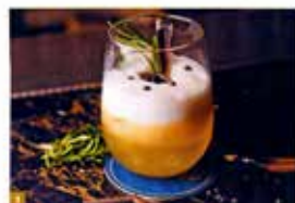
1 Saro Sour 2 Rum Negroni 3 Signature Monkey 25 4 The Signature Shell with a variety of toppings

Kenneth Perumattam, one of the partners behind Saro Lounge, explains that they hope to create an unforgettable experience for city dwellers. "Our vision is to offer Malaysian a business within the city that isn't just about the food and drinks, but the entire experience. An exquisite cocktail paired with flavorful dishes, complemented by eclectic tunes and a comfortable setting for you and your friends – it's about offering a combination that elevates all five senses," he says.